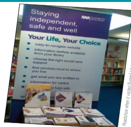
Roadshow when it visited Burrell Library in March 2013