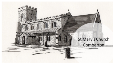
St Mary's Church Comberton