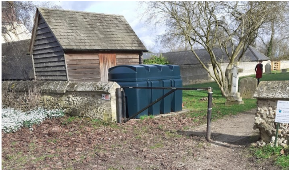
St Mary's Church - the Gateway from Carpark to North Door

Help us repair and restore. Our Fundraising efforts for 2023 are dedicated to the restoration of a section of Church wall, the levelling of the Carpark with re-stoning and to the provision of Two Dedicated Disability Parking Bays.