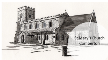
St Mary's Church Comberton